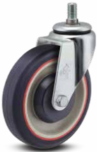
Standard Zinc plated