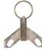
Swivel Locks available 14872 (for 3-1/4" wheels) 14783 (for 4" - 8" wheels)

Product will usually ship within 24-48 hours, depending on quantity.