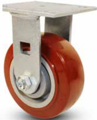
Brakes available on all swivel models