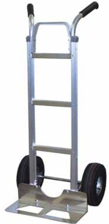
A11 B10 C13 D5